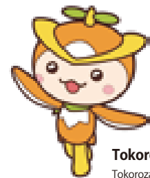
Tokoron, Tokorozawa's mascot